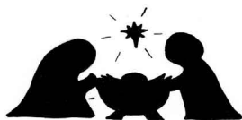
The Holy Family of Jesus, Mary & Joseph